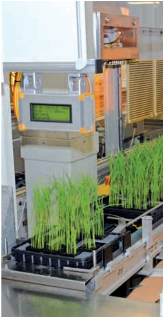
After the plants have passed through the current program, the data can be read on the display

ing them onto plants automatically. Depending on the effect of the application, further research is conducted in the laboratory, then in the greenhouse and finally outdoors.