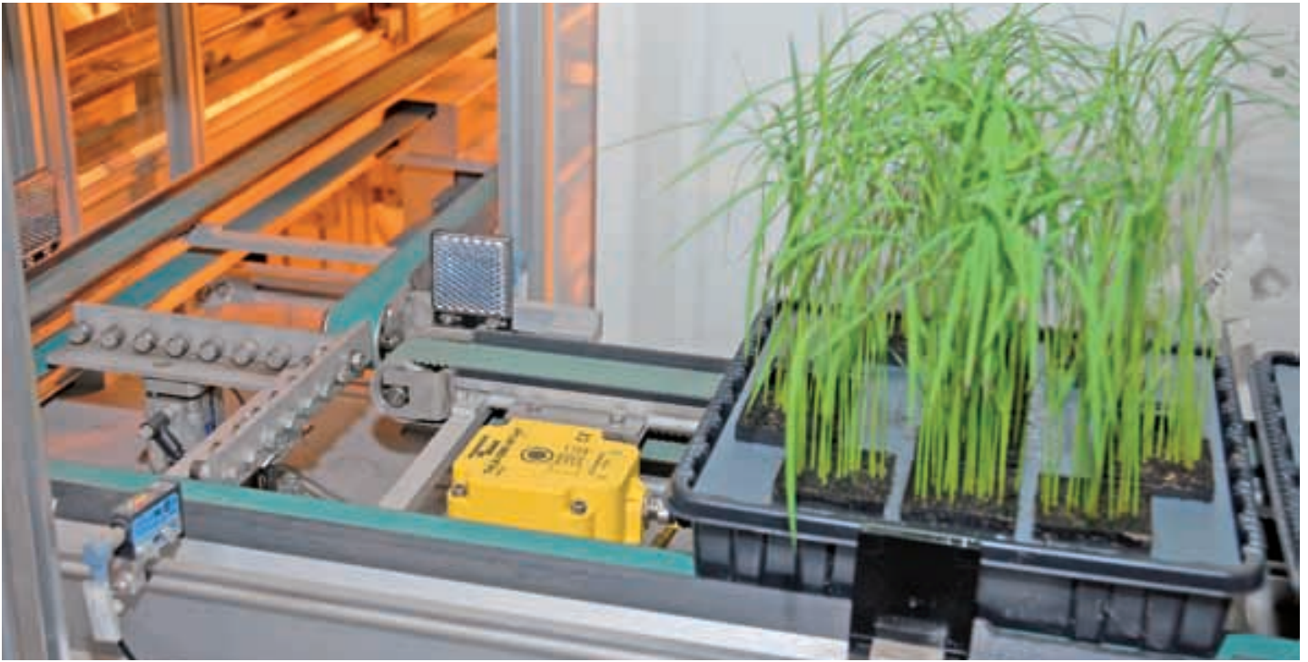
After the plant pots leave the spray units, all the relevant data is written onto the RFID tag in the middle of the plant pot