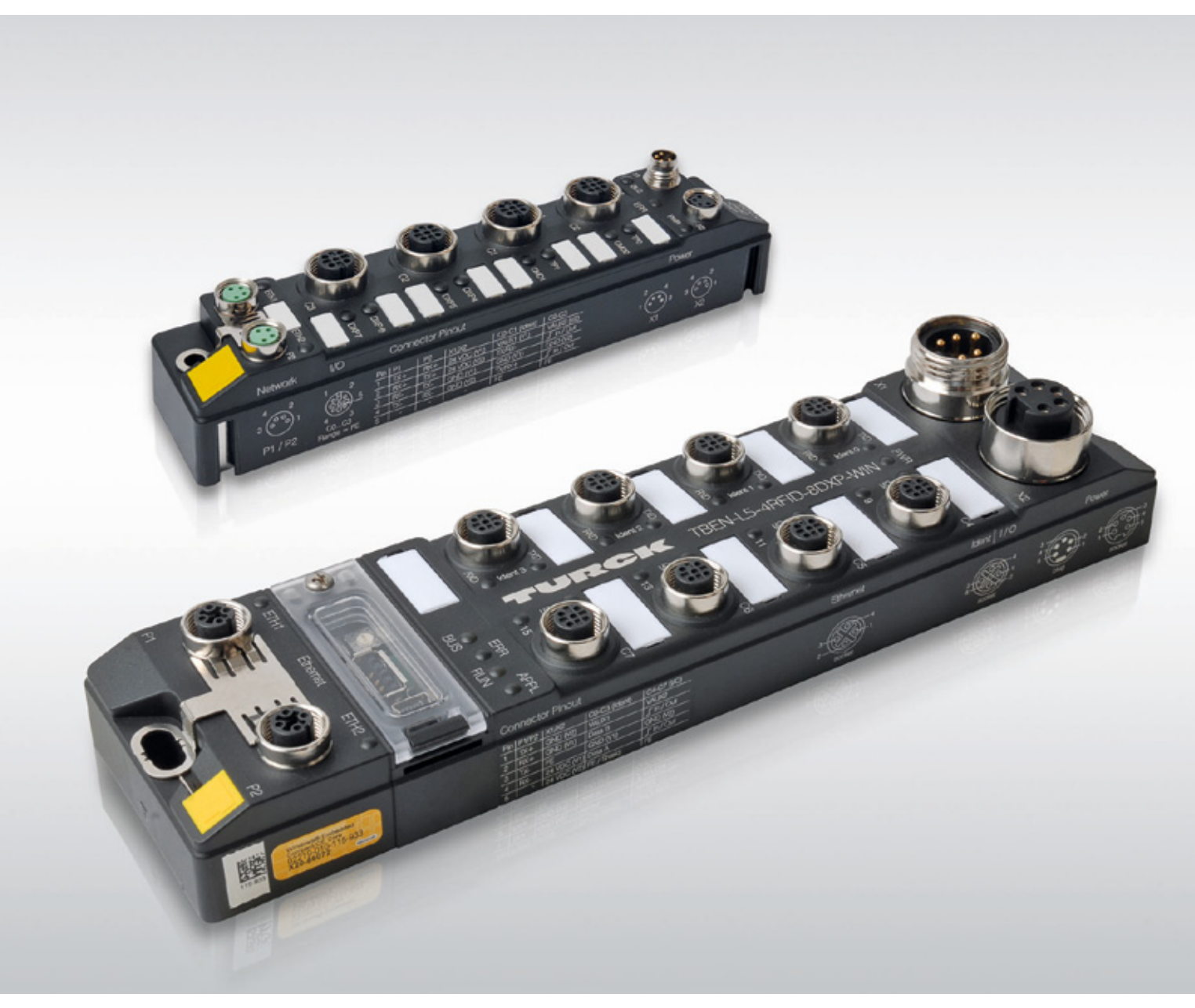
Compact, robust and simple: Turck's new TBEN-S and TBEN-L IP67 RFID interfaces reduce the effort involved in industrial identification solutions

Turck's new TBEN-S and TBEN-L Ethernet/RFID block I/O modules simplify the direct RFID integration of HF or UHF read/write heads in installations